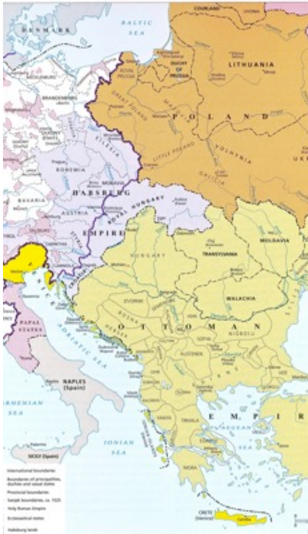
Central Europe, ca. 1570