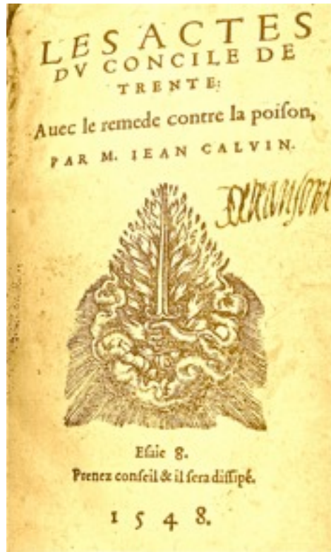
Front Page of John Calvin's Antidotum to the Council of Trent (1548)

For more information: Email: info@TolleLegeInstitute.org Web: TolleLegeInstitute.org Phone: (616) 826-4530 P.O. Box 150101 Grand Rapids, Michigan 49515